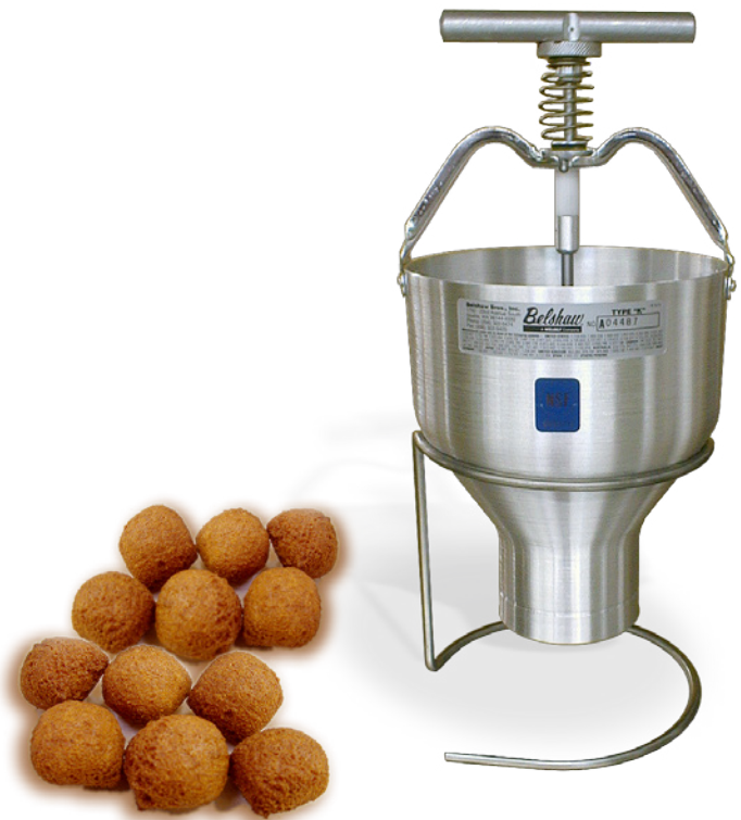
Above: Type K Hushpuppy Depositor with Holder Below: Item Number K-1016WSS Stand for Type K